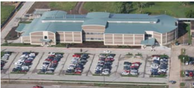
Science/Health Science Building

The new two-story, 98,790-square-foot facility offers four teaching theaters, an ambulance bay, simulation labs, modern skills and science labs and numerous lecture classrooms. In addition to having a state-of-the-art facility and equipment, students from all the different allied health groups will be able to work together in a simulated critical care setting just like in a real hospital.