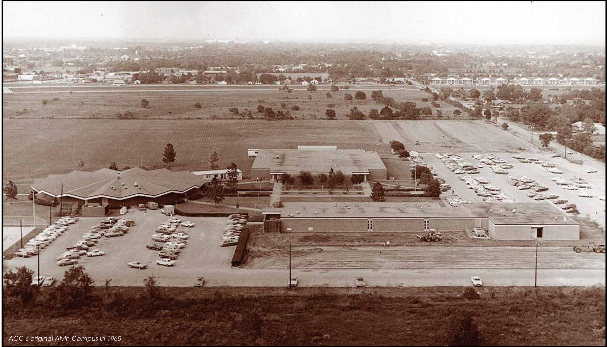
ACC's original Alvin Campus in 1965